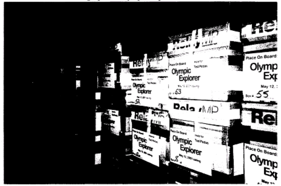
Photographs of Olympic Explorer Boxes at FASD